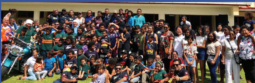
Visit to Dilkusha and Saint Christopher's Home