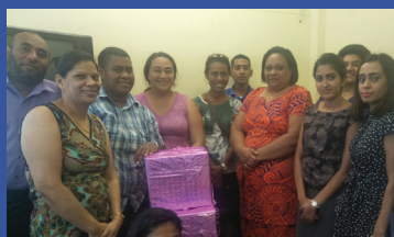
Visit to the Oncology Unit at CWM Hospital